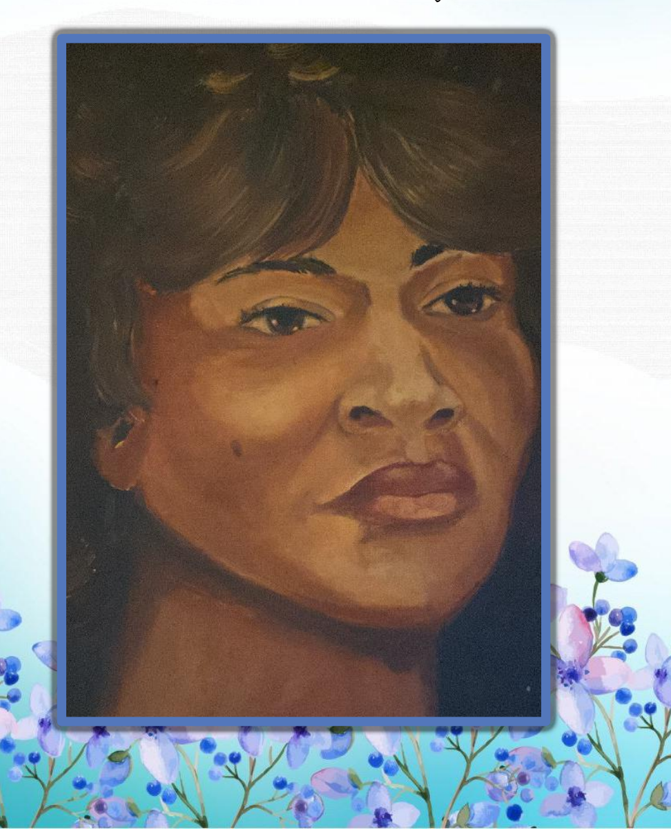
Sunset May 23, 2024