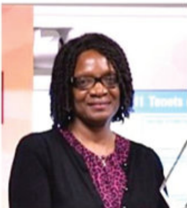
Born in the United Kingdom. Longtime Human Resources Manager at international law firm of Sullivan & Cromwell. Joined Toastmasters (America's Best) in 2003. Served as Sergeant-at-Arms, Treasurer, VP Education, President. Led our club to President's Distinguished Club honors. As Toastmasters Area Director, her Area achieved President's Distinguished Area honors from Toastmasters International. Mentor and friend to scores of Toastmasters through the years.