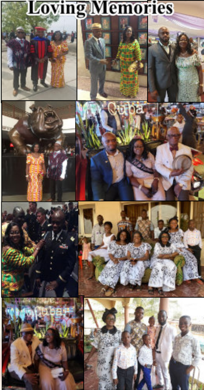
THE BEST MOTHER, WIFE, SISTER, AND AUNTIE WE COULD HAVE EVER ASKED FOR