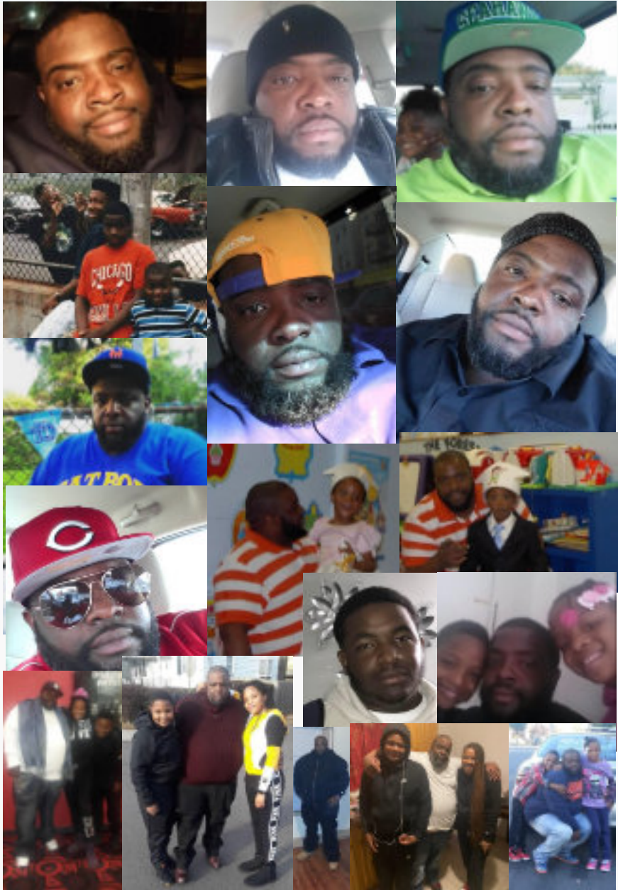
CREMATION Evergreen Cemetery Hillside, New Jersey