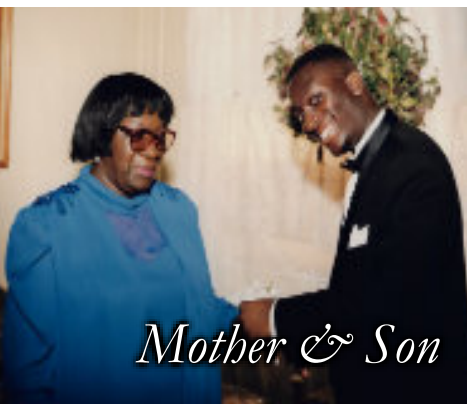
Mother & Son