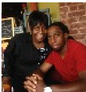
Love is the best thing you can give out of life. Success is nothing without love.