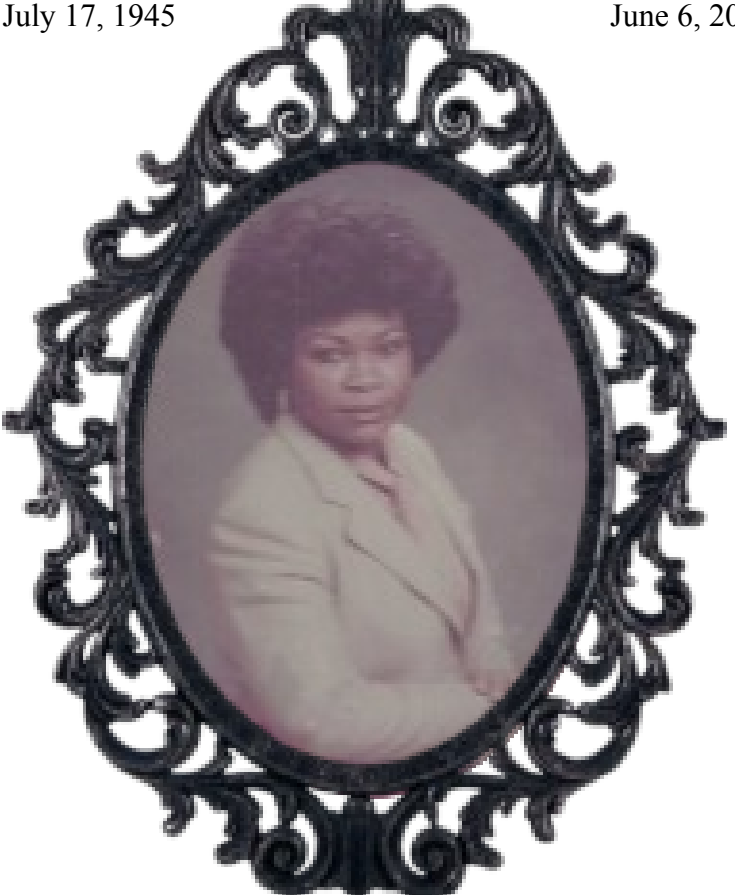
Sunset June 6, 2015