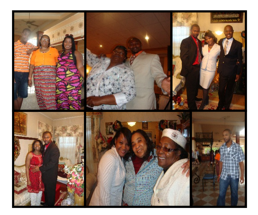
The time has come for me to leave for my journey here on earth is ended. You all remember the good times that we had together and keep smiling. I know you loved me but Jesus loves me best.